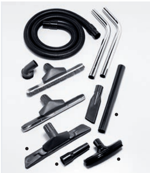
Standard accessories Ø 40 (plastic version)