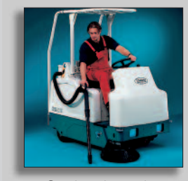
Overhead guard & vacuum wand