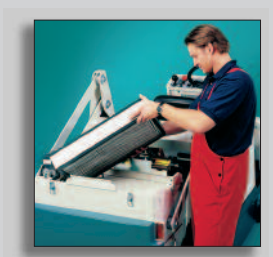
No-tool filter change