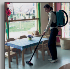
Machine in action