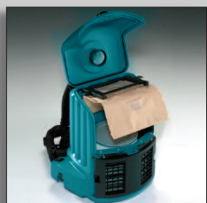
Easy to change filter bag